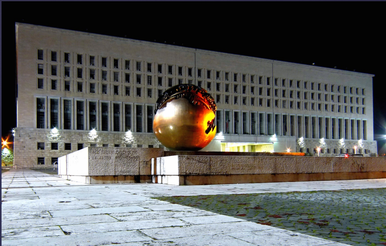
Office of the Italian Ministry of Foreign Affairs and International Cooperation