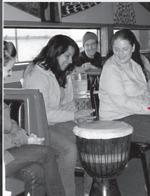
About 30 French students danced and drummed at the Dabakh Senegalese restaurant in Columbus.